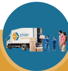
PACKERS & MOVERS