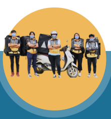
LAST MILE SERVICES