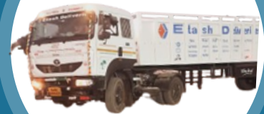
42 Tonner Trailer Truck