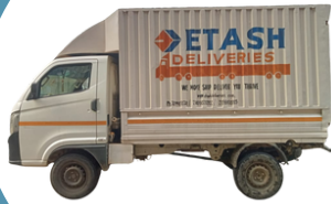
8 foot/14 foot mini Truck